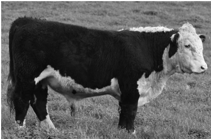
Lot 6: Maranui Force 210018