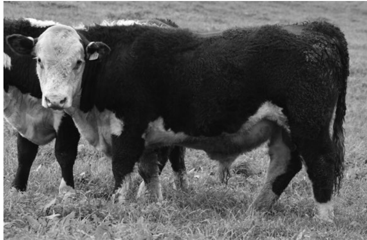
Lot 4: Maranui Force 210011