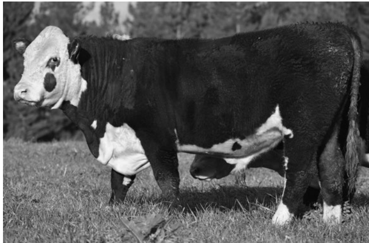
Lot 8: Maranui Marshall 210009