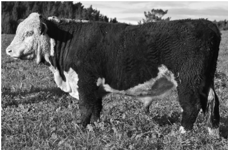
Lot 1: Maranui Marshall 210006