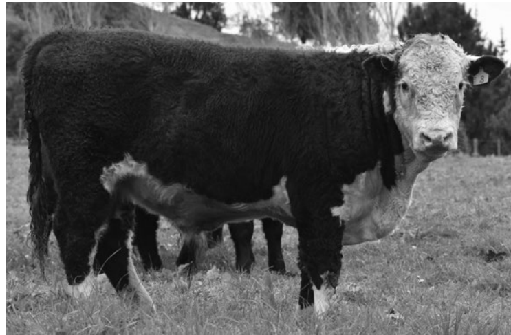
Lot 2: Maranui Force 210008