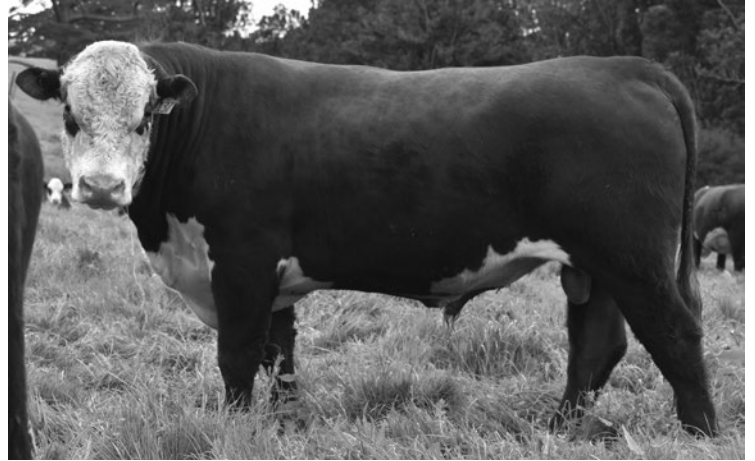
OTENGI STARTER 137