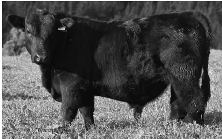
Lot 29: Maranui 210112