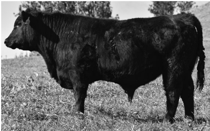
Lot 22: Maranui 210100