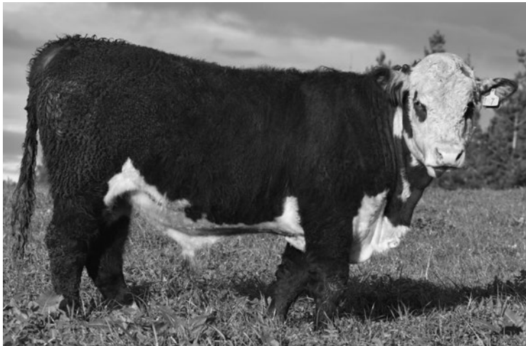
Lot 3: Maranui Starter 210007