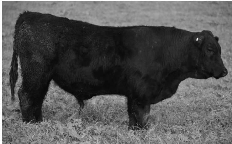
Lot 23: Maranui 210103